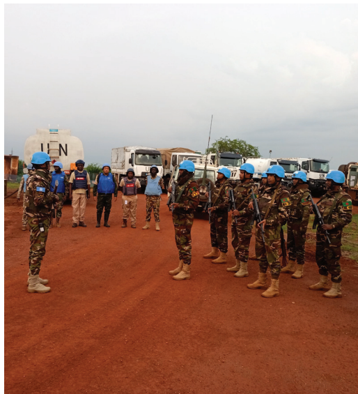
Ground Monitoring Mission in Tishwin