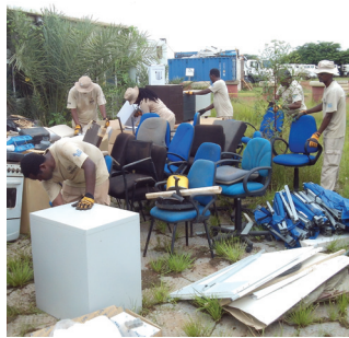
Photos: Cleanup, thorough check of the office, safety induction and explosive device found