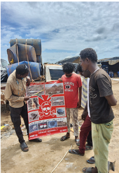
Explosive ordnance safety briefing

Six Community Liaison Officers, representative of the Abyei Area's demographics, raise community awareness of explosive hazards and act as focal points for reporting.