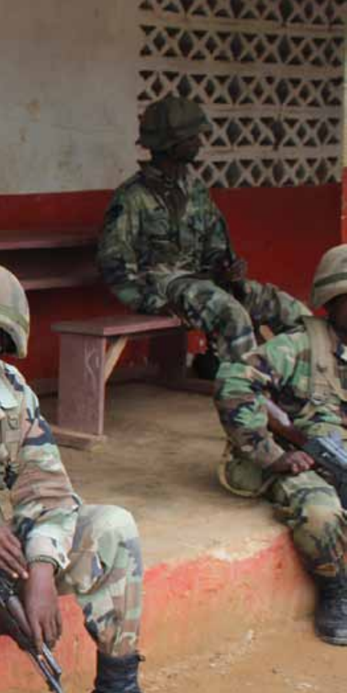
Members of the Armed Forces of Liberia keeping vigil at the border

Ivorian dissidents and fugitives. At a quadripartite emergency meeting convened in Abidjan following the attack, the UN called for a reinforcement of cooperation between Liberia and Côte d'Ivoire. UNMIL and UNOCI reaffirmed UN support for efforts to consolidate peace in the sub region, and announced plans to intensify patrols along the common border.