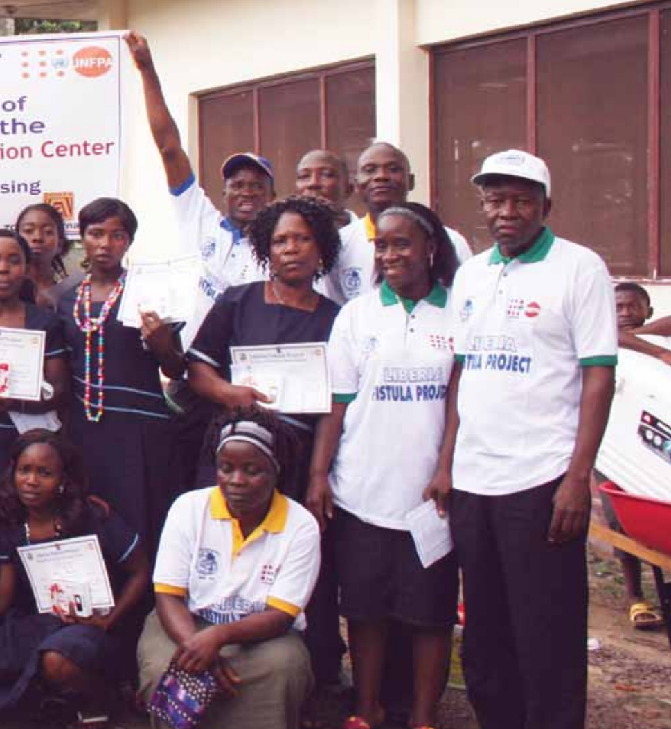
Proud graduates display their certificates