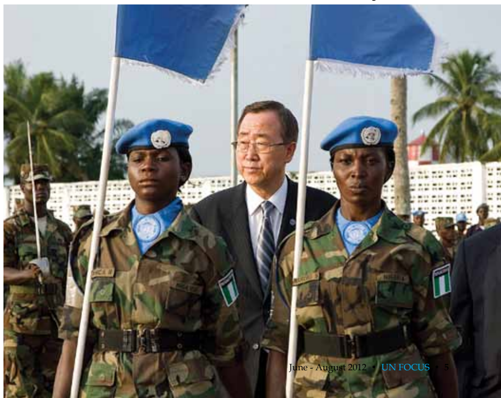
Ban Ki-moon during a visit to Liberia

peacekeeping force in Liberia since 2003 to bolster a ceasefire agreement ending a decade of war that killed nearly 150,000 people, mostly civilians. UNMIL's mandate includes helping to restore the rule of law and democratic processes as well as facilitating humanitarian assistance. ■