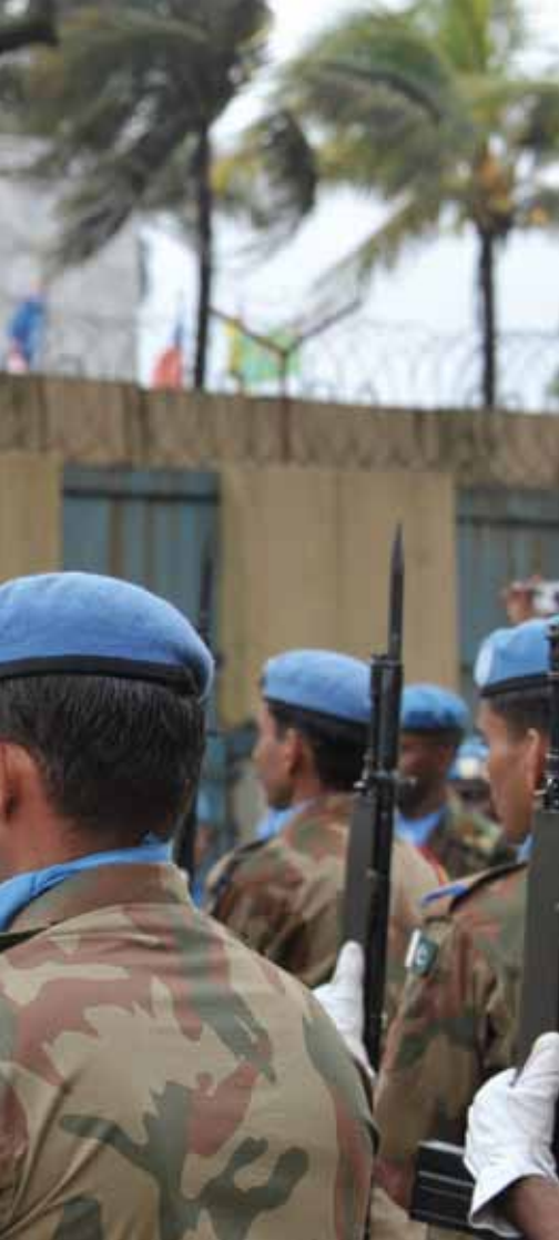
Liberia has enjoyed peace since the arrival of peacekeepers in 2003

presence in the country be gradually reduced by about 4,200 troops in three phases between this year and 2015, when it will have a residual presence of approximately 3,750 peacekeepers.