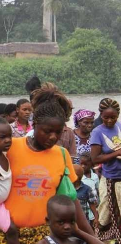
Liberian refugees return home

We thank the UNHCR for facilitating our return.”