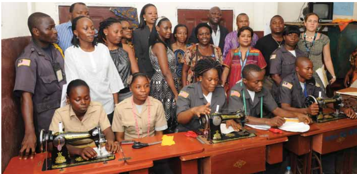
Launch of re-usable sanitary pads