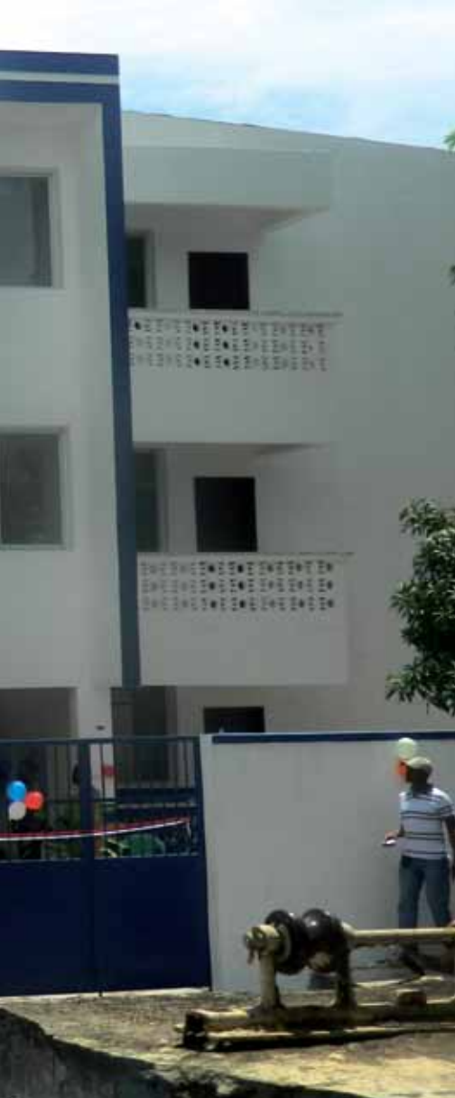
The newly built barracks