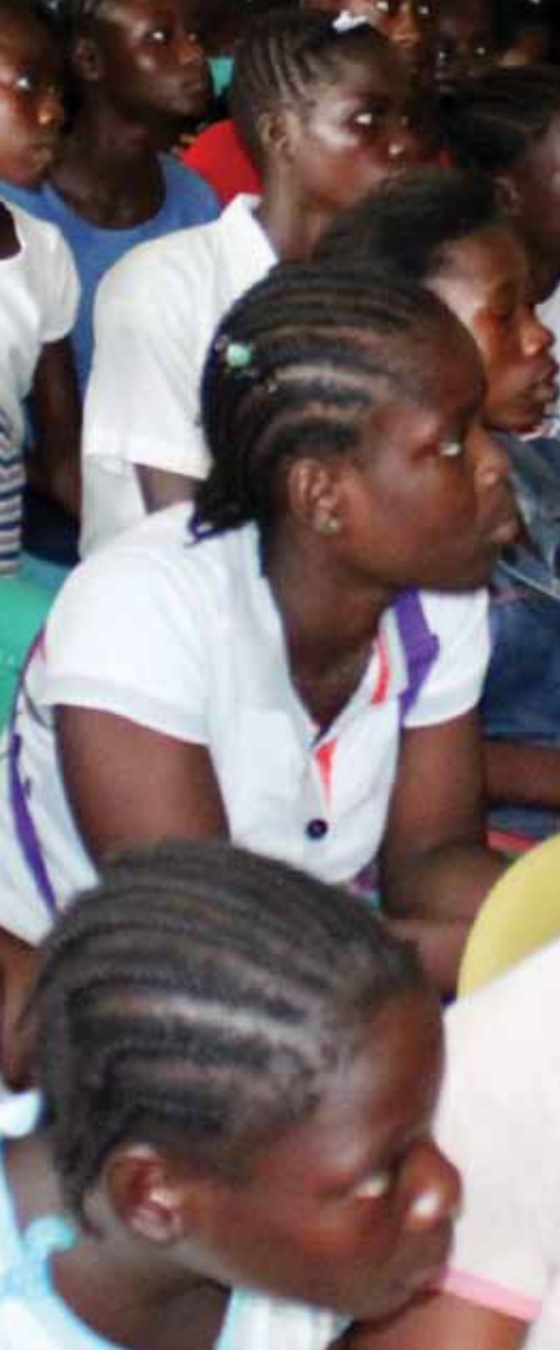
Adolescent girls attend a training programme