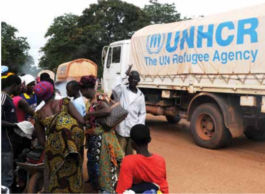
Refugees being relocated