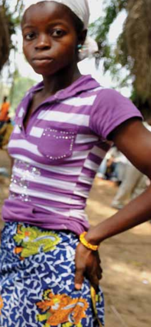
A UNHCR official helps newly arriving refugees

blankets, cooking utensils, and go through biometric screening. Refugees are also briefed on the dos and don'ts while in refuge.