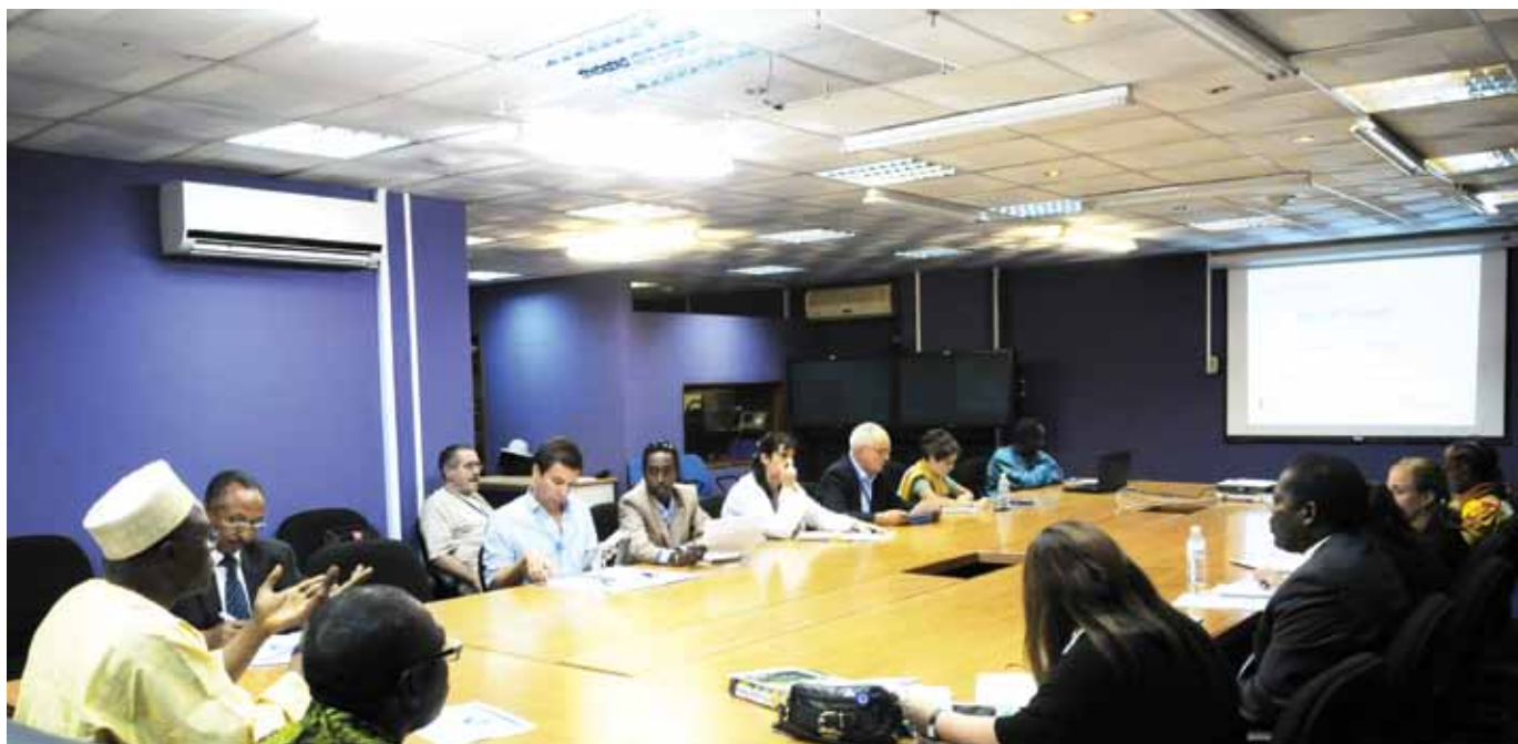
The Appeal seeks funds for 36 projects