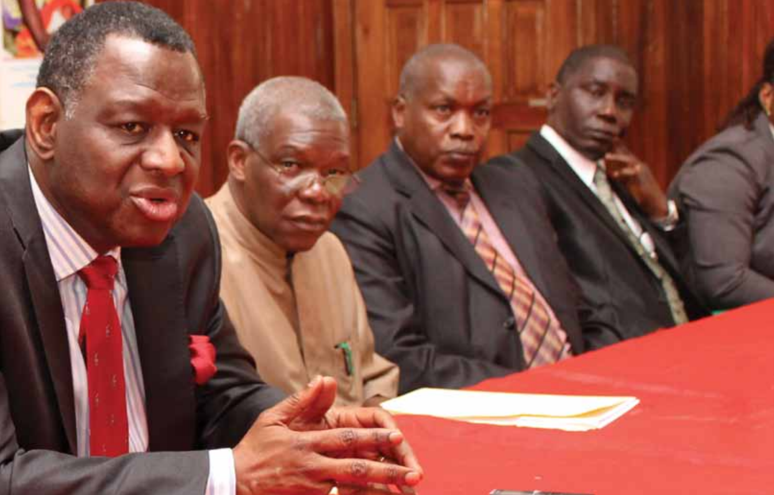
Osotimehin addresses a meeting