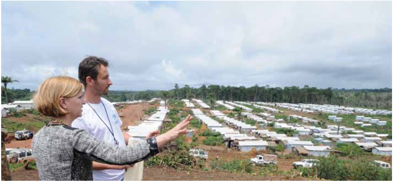
Karin Landgren visits refugee camp